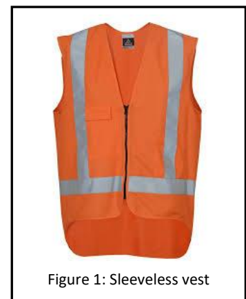
Figure 1: Sleeveless vest

The NZTA specification is based around AS/NZ4602.1:2011 and AS/NZS1906.4:2010, except with more detail and additional requirements. Retro-reflective tape and high-visibility background material must conform to AS/NZS1906.4:2010.