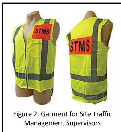
Figure 2: Garment for Site Traffic Management Supervisors

There are four garment design categories - sleeveless vests, long sleeves coats, overalls and miscellaneous (e.g. polo shirts, woven shirts, polar fleeces). All of these designs are closely specified in terms of garment length, shirt tails, tape length, tape configuration and logos.