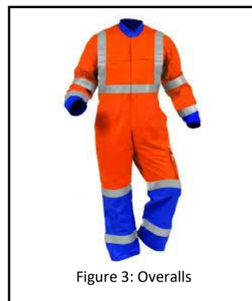
Figure 3: Overalls

The NZTA COPTTM specifies two main colours with regards to use on New Zealand roads: